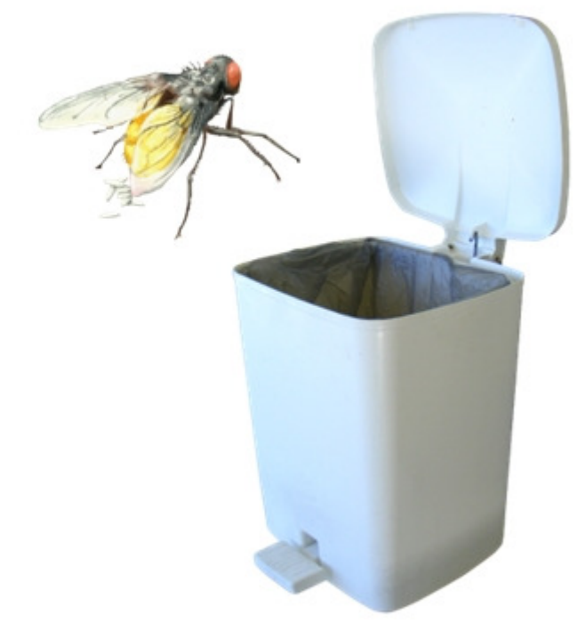
A kitchen rubbish bin with a lid is best.