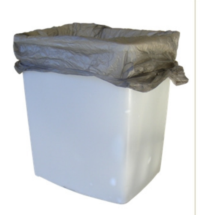
Line kitchen rubbish bin with a plastic bag.