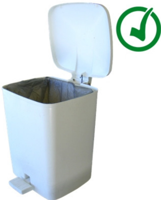
Lined rubbish bin