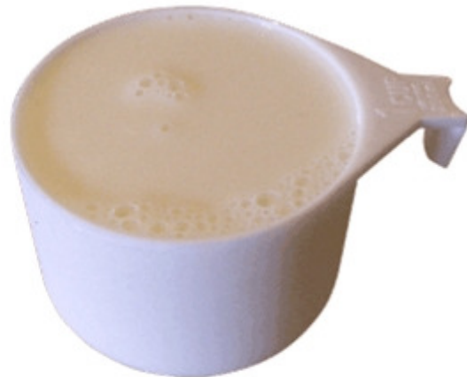
1 cup of milk