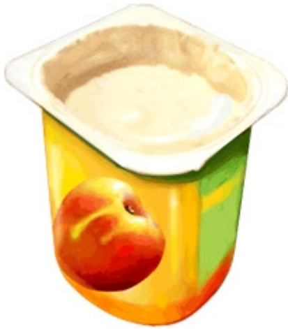
1 small tub of yoghurt