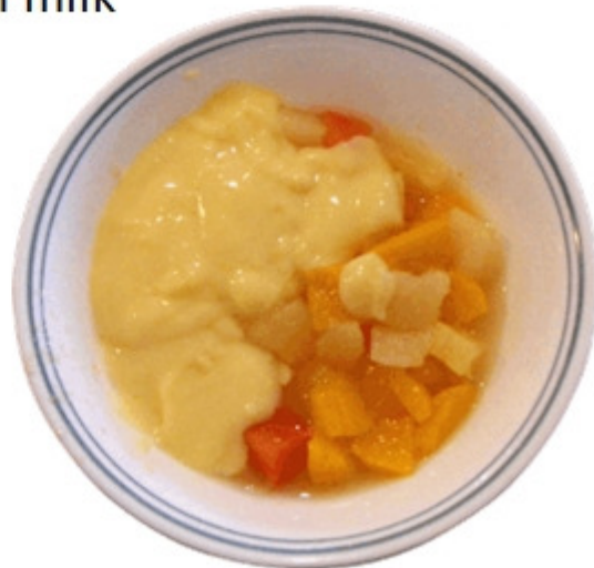
Fruit and custard