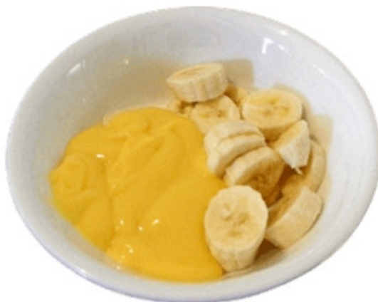
Banana and custard