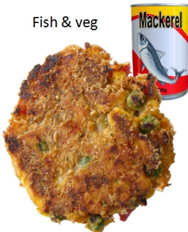
Fish & veg