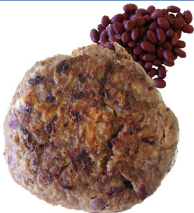
Meat & bean