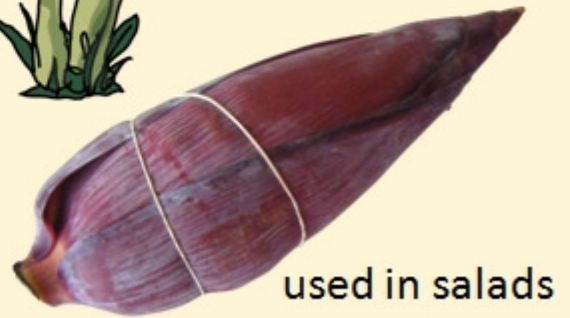
used in salads