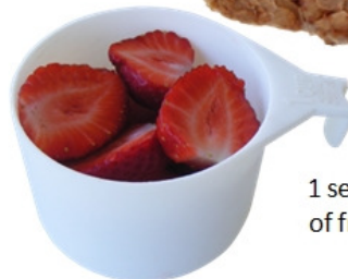
1 serve of fruit