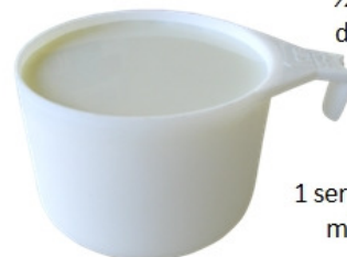
1 serve of milk