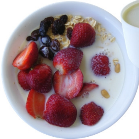
6 Add milk and mix