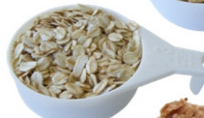
2 serves of cereal