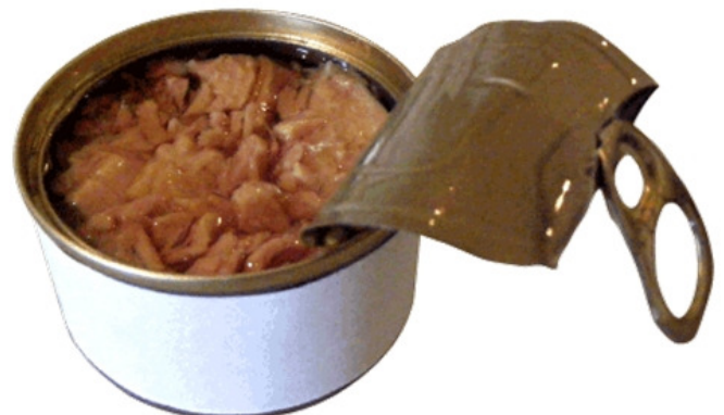
1 small tin of fish (100g)

Copyright – John Austin © Australia 2013. Licence Personal Use AHP-A0-6/2015 Expiry date: 31 Dec 2018