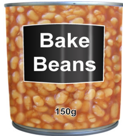
1 small tin of baked beans

Copyright – John Austin © Australia 2013. Licence Personal Use AHP-A0-6/2015 Expiry date: 31 Dec 2018