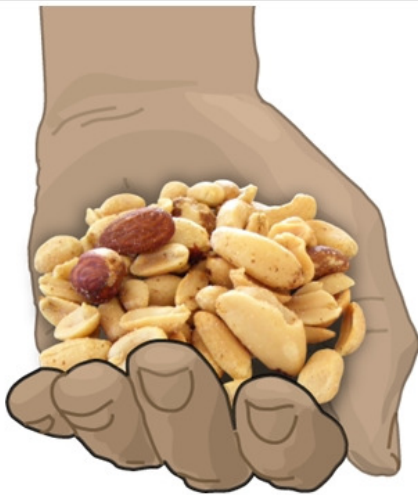
1 hand of nuts

Licence Personal Use AHP-A0-6/2015 Expiry date: 31 Dec 2018