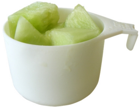
1 serve honey dew melon

Licence Personal Use AHP-A0-6/2015 Expiry date: 31 Dec 2018