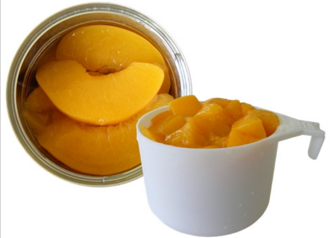
1 cup tinned fruit