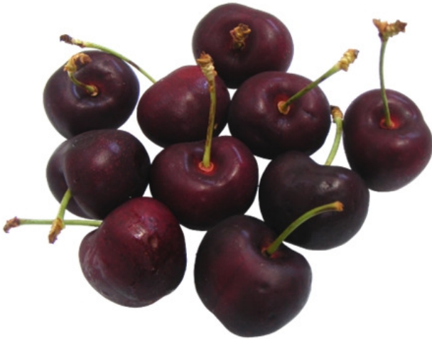
1 serve cherries

Licence Personal Use AHP-A0-6/2015 Expiry date: 31 Dec 2018