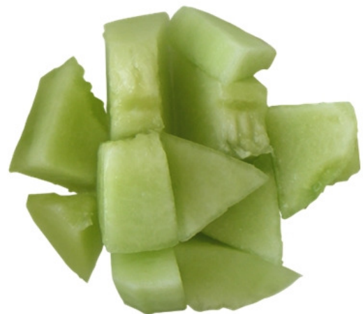
1 serve honey dew melon

Licence Personal Use AHP-A0-6/2015 Expiry date: 31 Dec 2018