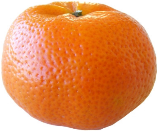
1 medium piece of fruit