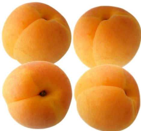
1 serve apricots

Copyright – John Austin © Australia 2013. Licence Personal Use AHP-A0-6/2015 Expiry date: 31 Dec 2018