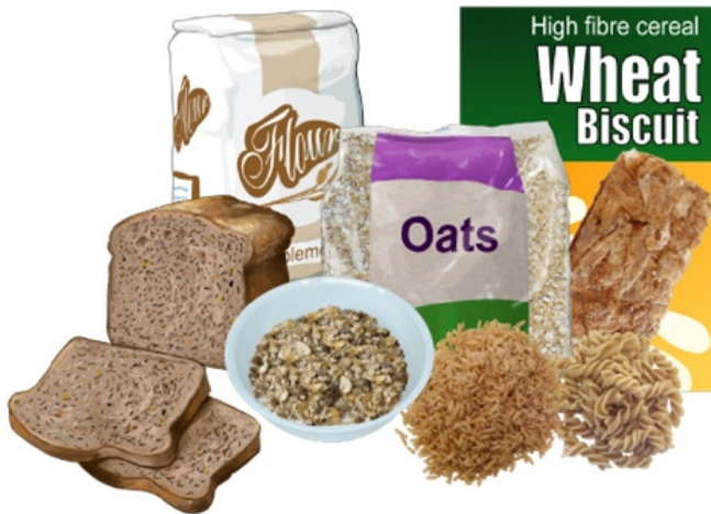
Wholemeal & Wholegrain Cereals

CDRO Copyright - John Austin © Australia 2013. Licence Personal Use AHP-A0-6/2015 Expiry date: 31 Dec 2018 Chronic Disease Resources Online