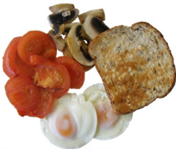
Egg, Tomatoes & Mushrooms