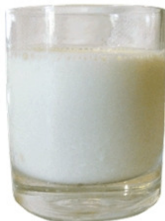
Glass of Milk

Licence Personal Use AHP-40-6/2015 Expiry date: 31 Dec 2018