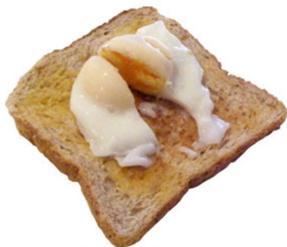
Egg on Toast

Licence Personal Use AHP-40-6/2015 Expiry date: 31 Dec 2018 Chronic Disease Resources Online