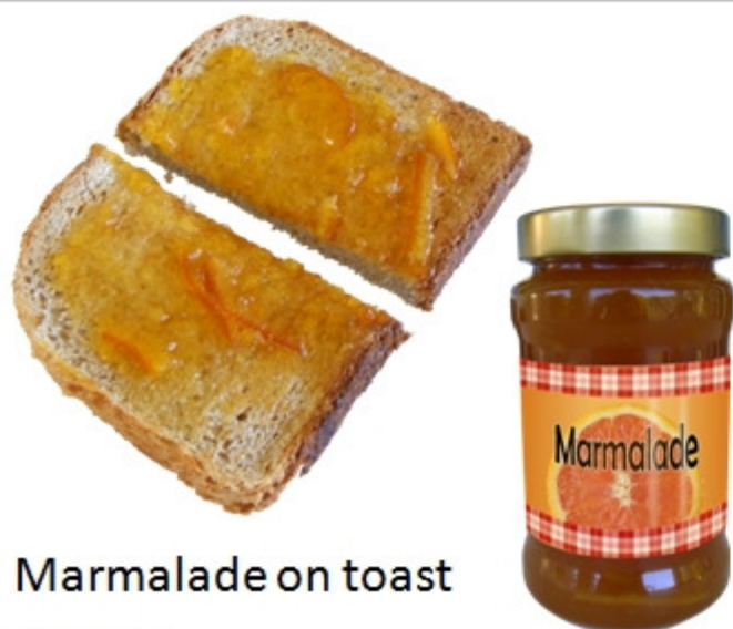
Marmalade on toast

Licence Personal Use AHP-40-6/2015 Expiry date: 31 Dec 2018