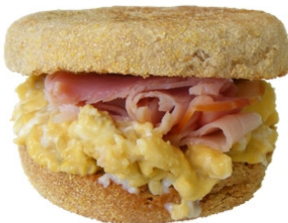
Ham & Egg Muffin

Licence Personal Use AHP-40-6/2015 Expiry date: 31 Dec 2018