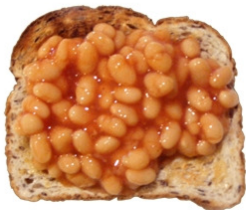
Baked Beans on Toast