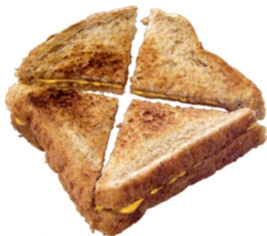
Cheese on Toast

CDRO Copyright - John Austin @ Australia 2013. Licence Personal Use AHP-40-6/2015 Expiry date: 31 Dec 2018 Chronic Disease Resources Online