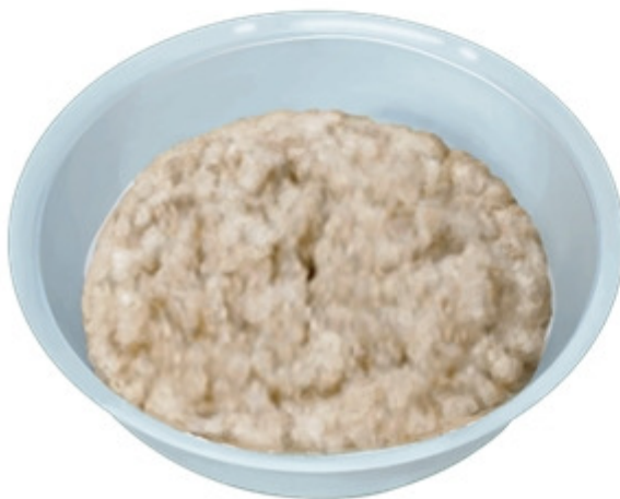
Porridge with Milk