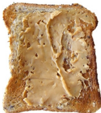
Peanut Butter on Toast

Licence: Personal Use AHP-40-6/2015 Expiry date: 31 Dec 2018