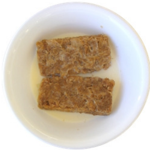
Weet-bix with Milk

Licence Personal Use AHP-40-6/2015 Expiry date: 31 Dec 2018 Chronic Disease Resources Online