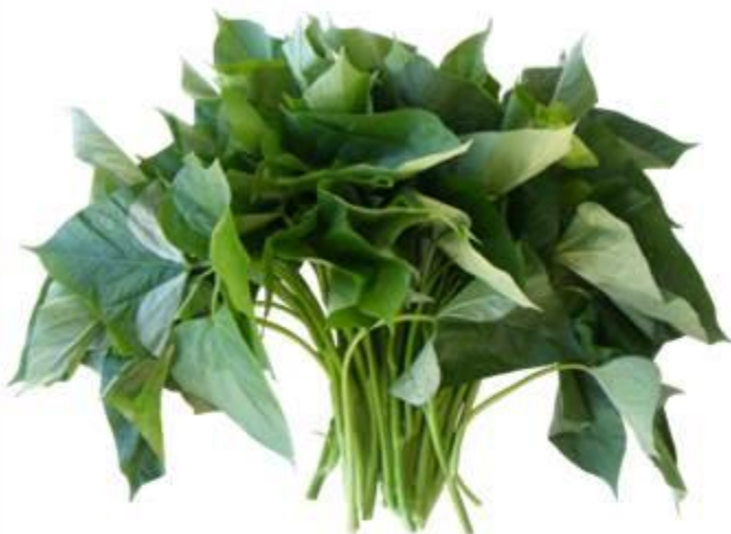
Sweet potato tops

CD CDRO Copyright –John Austin © Australia 2017. RO Licence Personal Use AHP-A0-6/2015 Expiry date:31 Dec 2019