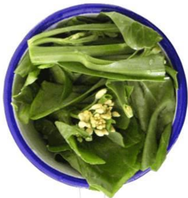
Chinese broccoli (Use 2 mugs when uncooked)

CD CDRO  RO Licence Personal Use AHP-A0-6/2015 Expiry date:31 Dec 2019