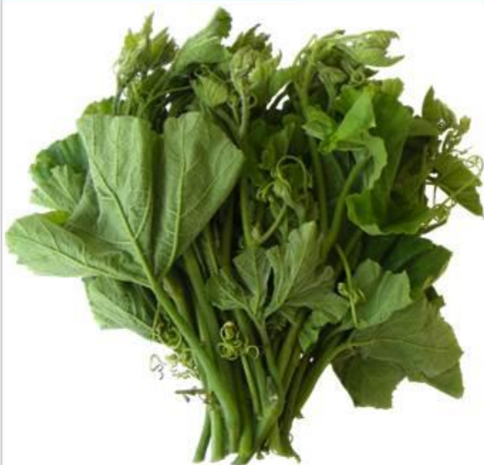
Pumpkin tips (Use 2 mugs when uncooked)

CD CDRO Copyright –John Austin © Australia 2017. RO Licence Personal Use AHP-A0-6/2015 Expiry date: 31 Dec 2019