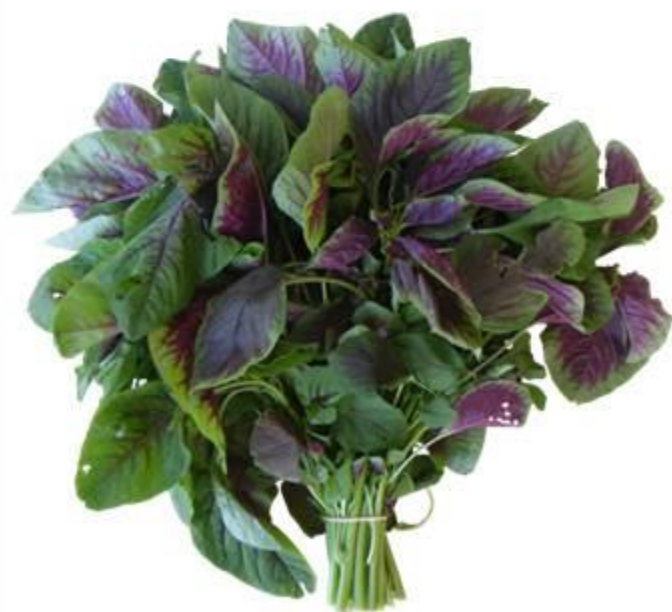
Amaranth (Use 2 mugs when uncooked)

CD CDRO  RO Licence Personal Use AHP-A0-6/2015 Expiry date: 31 Dec 2019