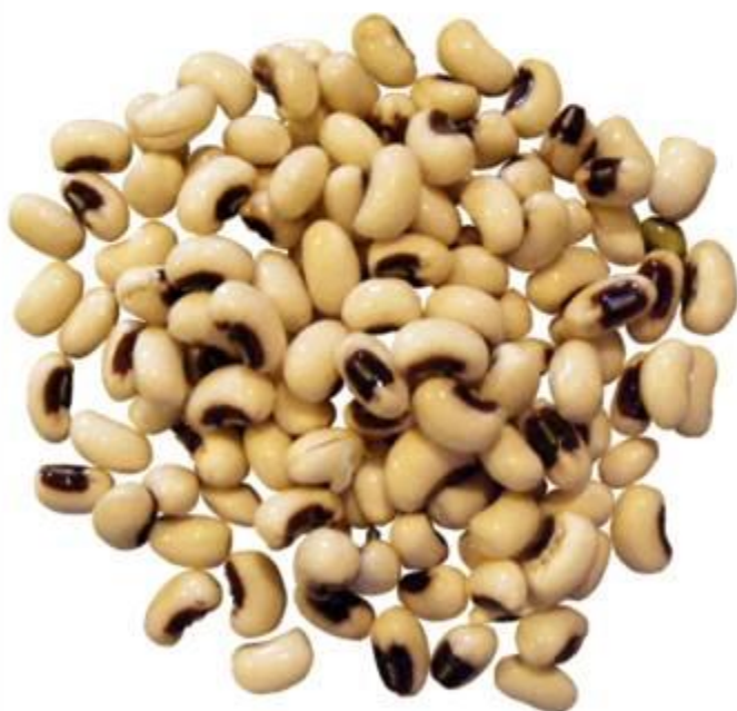
Black eyed beans

CD RO CDRO Copyright –John Austin © Australia 2017. Licence Personal Use AHP-A0-6/2015 Expiry date: 31 Dec 2019