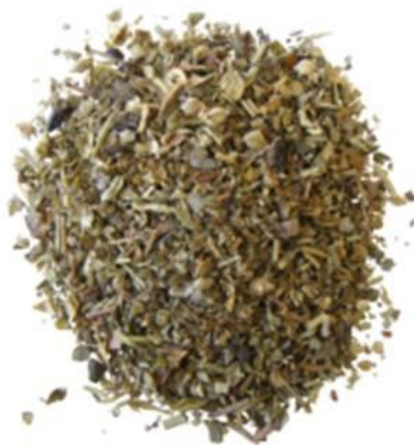
Italian mixed herbs

RO Licence Personal Use AHP-A0-6/2015 Expiry date:31 Dec 2019