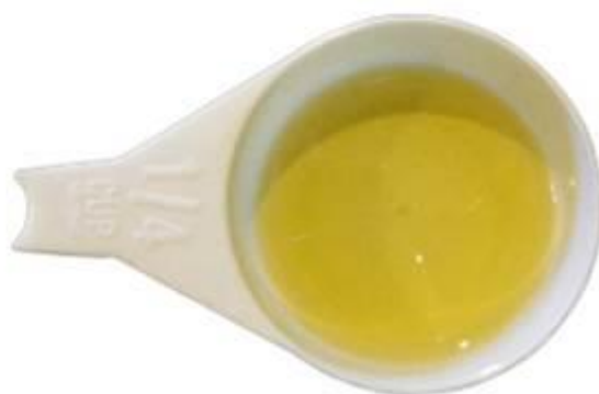
Canola oil is good

CD CDRO Copyright –John Austin © Australia 2017. RO Licence Personal Use AHP-A0-6/2015 Expiry date:31 Dec 2019