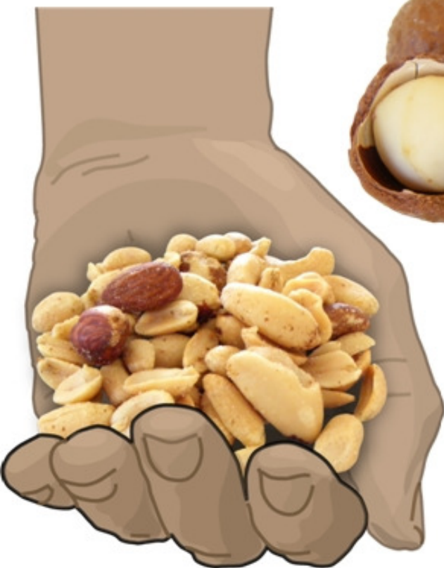
1 serve nuts